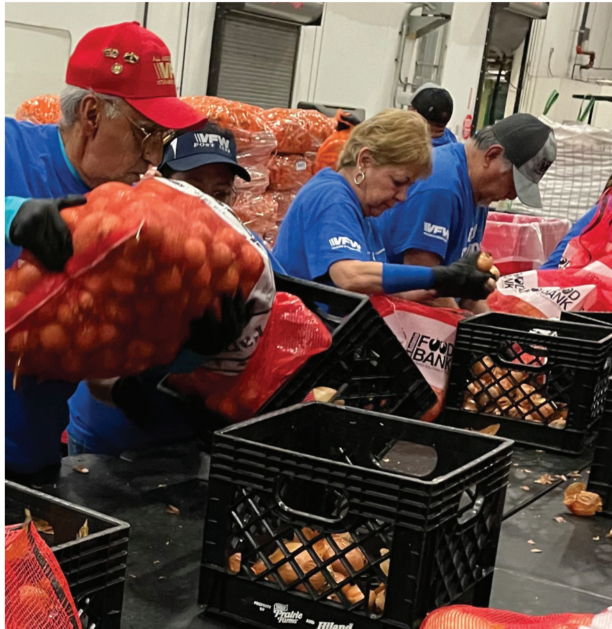
Members of VFW Post 1533 and its Auxiliary in San Antonio sort and pack potatoes in the San Antonio Food Bank's warehouse during their VFW Day of Service in May. VFW's second annual Day of Service grew its total number of grassroots events by more than 20 percent from the first year. VFW Posts in all 50 states, as well as those in Europe, Guam, Asia and Puerto Rico, participated.

For their VFW Day of Service in May 2023, VFW Post 1533 members in San Antonio split their time into two volunteer sessions at the San Antonio Food Bank.