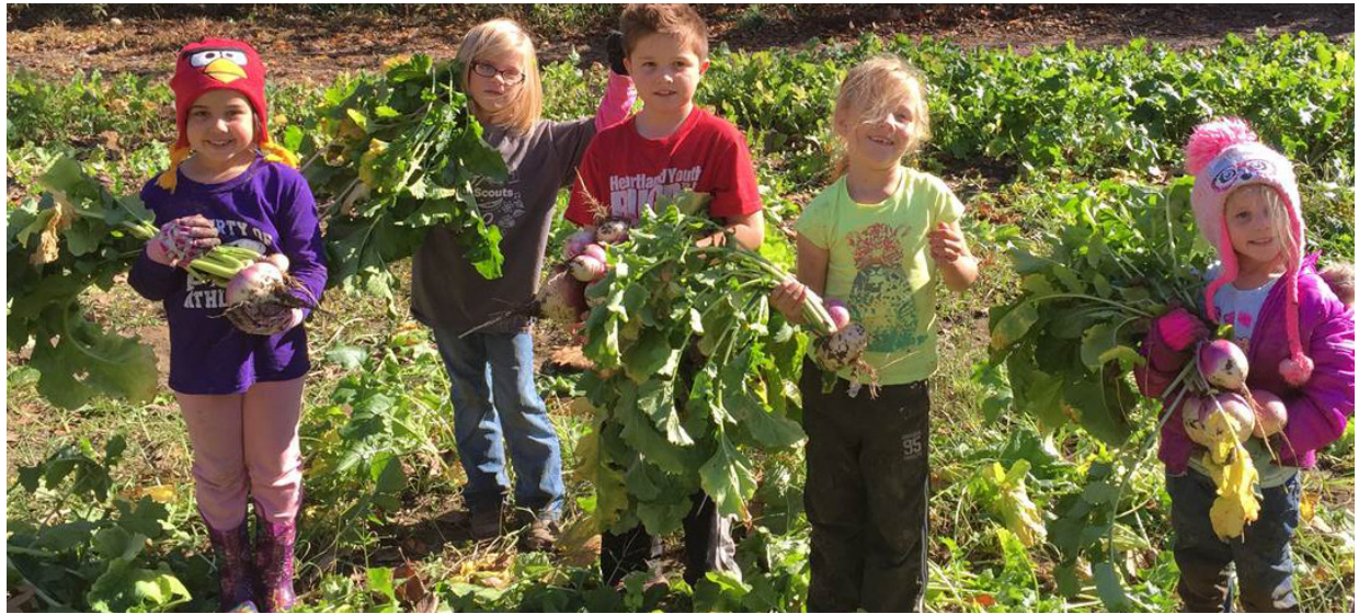
Volunteers glean crops in the Kansas City metropolitan area to give to local food pantries to help fight hunger. Gleaning is picking edible crops that remain in the fields or orchards after a harvest. The produce is often aesthetically unappealing, but offers the same nutritional value as the rest of the crop. VFW's national convention in Kansas City in July will provide more opportunities for those wanting to help.