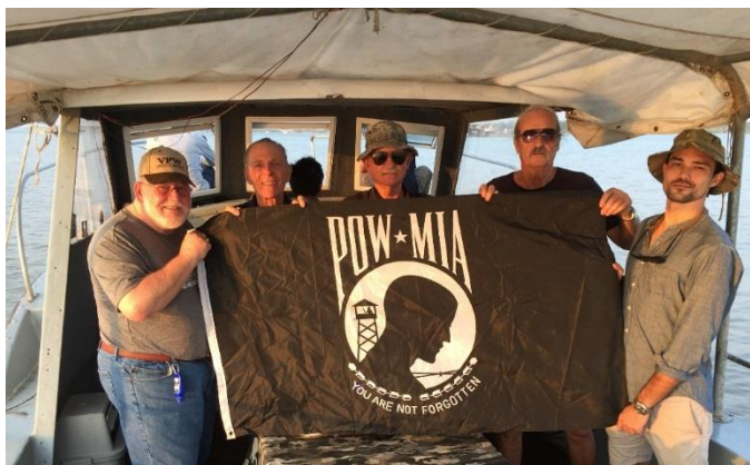
On the Mekong River aboard a former Vietnam War riverine boat with members of VFW Post 11575, Phnom Penh, Cambodia.

The 49 Americans currently listed as MIA are the toughest of the tough to resolve because the Khmer Rouge's four-year destruction of libraries, and subsequent genocide of an estimated 1.7 million fellow Cambodians, left few records or witnesses. The ongoing recovery operation is an aircraft crash that left a 1,500-square-meter debris field, yet DPAA is hopeful because the site is undisturbed, as local villagers did not scavenge metal after the crash. There is another hopeful site, but a border dispute with neighboring Laos has to be resolved before U.S. teams are able to return to the location.