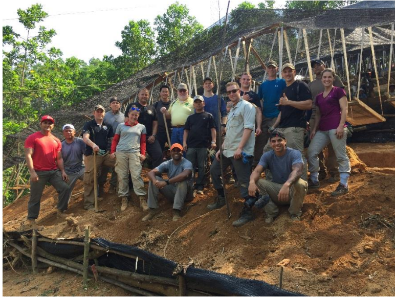
Making the effort to thank the troops for what they do out in the field means everything. With a DPAA recovery team in Quang Nam Province, two hours west of Da Nang, Vietnam.

The next day we journeyed two hours west into the central highlands of Quang Nam Province. There we were hosted to lunch by three deputy directors of the VNOSMP, or Vietnam Office for Seeking Missing Persons, a government organization comprised of representatives from the Vietnamese Ministries of Defense, Foreign Affairs and Public Security.