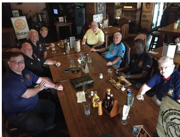
Lunch meeting in Bangkok with seven comrades from District 5, VFW Department of the Pacific.

Journeying to Southeast Asia also gave me an opportunity to meet with almost a dozen VFW comrades residing in Thailand and Cambodia to hear their concerns. Communication is key with all our members, but even more so for those residing in foreign countries. Their concerns about VA's Foreign Medical Program travel reimbursements and service officer access to the VA's Veterans Benefits Management System web portal were noted, the VBMS issue especially, since this also impacts VFW service officers in Europe. The issue centers entirely on Internet security, since folks residing overseas can only use that country's Internet service provider. VFW National Veterans Service is in discussions with the VA Central Office and the Departments of Pacific Areas and Europe on ways to resolve the overseas remote access issue.